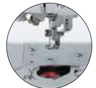
Programmed thread cutting