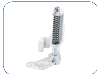
SA129 Quilting Foot A spring action, clear quilting foot marked for easy reference that handles a variety of fabric thicknesses.