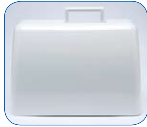
Hard case included with NS-80 only.