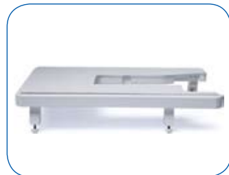
SA552 Wide Table For easier handling of fabrics when sewing or working with quilting or large projects.

For more information please call 1-877-BROTHER (1-877-276-8437) or visit our web site: brother.ca