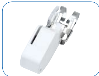
SA140 Walking Foot Ensures an even feed action when sewing multiple layers of fabric or when matching fabric prints.